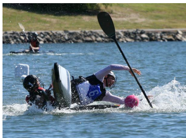
The modern game is fast and exciting as this (illegal) tackle shows.

The author wishes to acknowledge the various sources that have provided the material for this history. Along with the references given below, many players have shared their recollections of the game's changes over recent years and the Internet has been invaluable; providing access to the web sites and histories of clubs and other groups from around