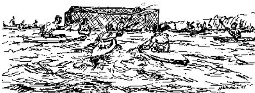
Kanupolo – Germany circa 1935. Geschichte des kanupolo, Deutsche Meisterschaften, vom 2, 5 Sep 2004