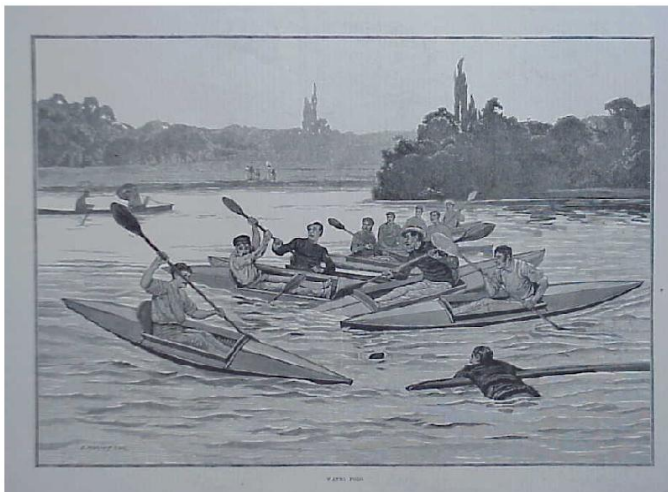
Water Polo. The Graphic, 1884.

An international competition beckoned. An enthusiastic following had grown through the schools in England and